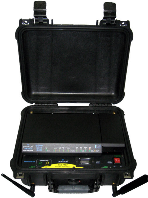
Cell-PAK Model CP1-LC2 (shown with LAN-Cell 2 installed)

The Cell-PAK is a rugged, self-powered case for that transforms Proxicast's LAN-Cell 2 into a portable 3G Wi-Fi HotSpot.