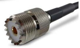
UHF Female SO-239