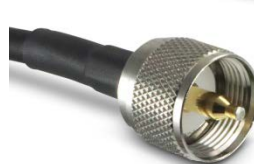
UHF Male PL-259