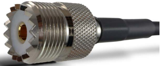
UHF Female SO-239

Look for the Logo Band on Genuine Proxicast Coax Cables