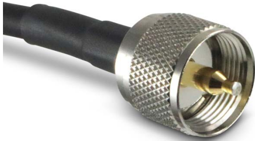
UHF Male PL-259