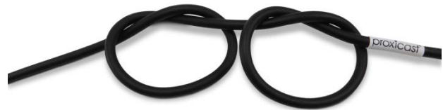
Proxicast HDF UltraFlex-240

Look for the Logo Band on Genuine Proxicast Coax Cables