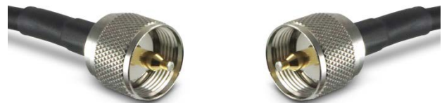
UHF Male PL-259