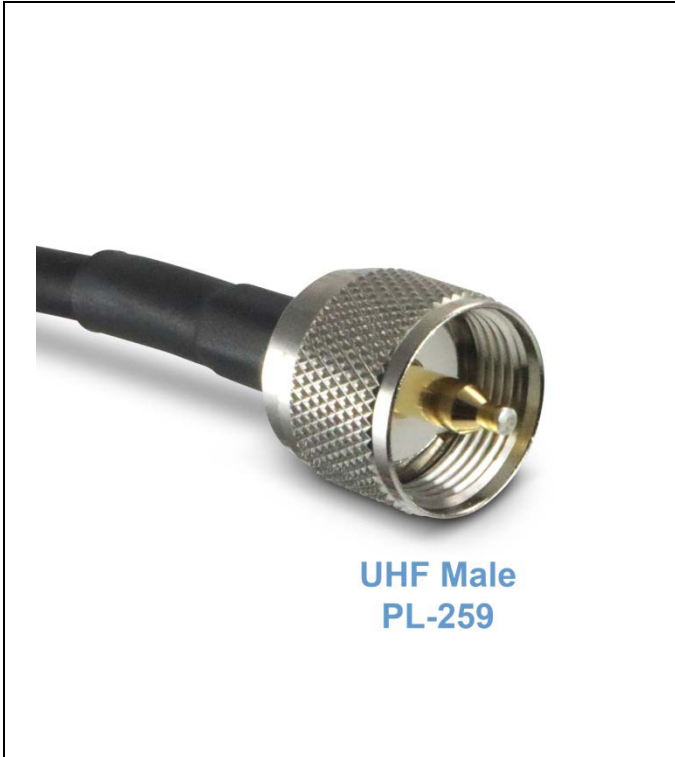
UHF Male PL-259